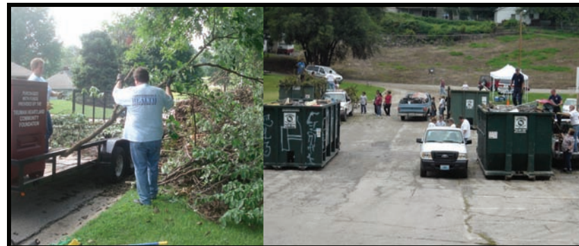
Staff assists during a neighborhood clean-up scheduled through the NCCP.