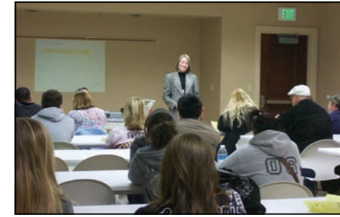
Staff teaching a food safety training class.