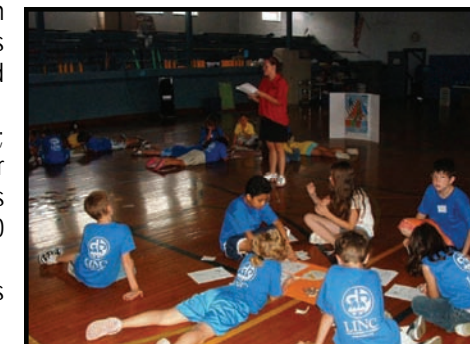
Kids learn good nutrition through the Kid Power program.