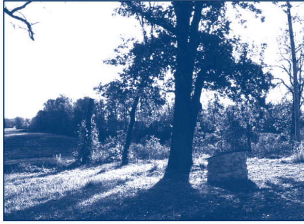
Little Blue Bridge Site

On October 21-22, 1864, some 15,000 Union and Confederate forces fought along the banks of the Little Blue River in eastern Independence. It is estimated there were about 500 Union casualties and 500 Confederate casualties on this "hallowed ground." It was hoped by the Confederacy that this push by General Price into Missouri would take pressure off the Eastern Front. However, by virtue of its failure, Price's raid assisted in bringing closure to the Civil War by 1865. This two-day battle slowed the advances of the Confederates and served as a prelude to the Second Battle of Independence, Byram's Ford (Big Blue) and the Battle of Westport (the largest Civil War battle west of the Mississippi River). Let us not forget, "we here highly resolve that these dead shall not have died in vain."