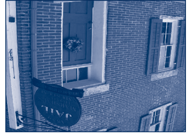
1859 Jail & Marshal's Home