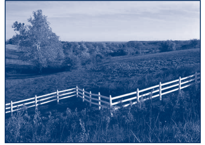
24 Highway & Blue Mills Road