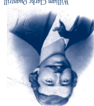
William Clarke Quantrell

At approximately 6:30 am when all of the Federals were inside the building Quantrell completed his encirclement.