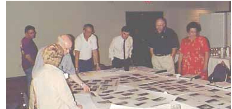
Members of the Steering Committee and City Staff review photos for the Visual Preference Study.

The Economic Restructuring Committee was instrumental in compiling a preliminary economic development incentive package to supplement the recommendations and implementation program of the Square revitalization Strategy. These proposed incentives and assistance programs were presented for discussion at a public forum in July 2001 entitled "The Buck Starts Here". Over 60 individual property