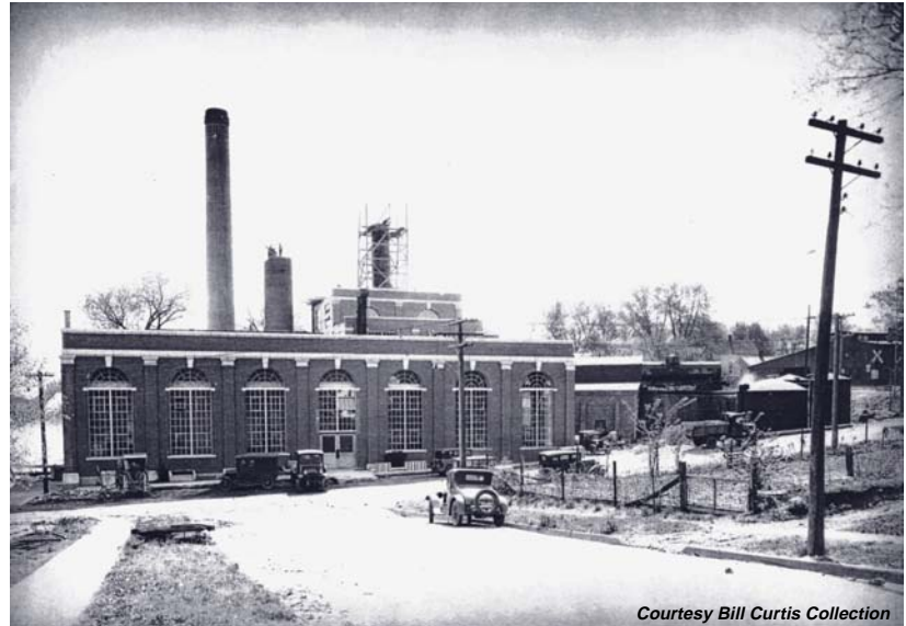
In 1931, the Dodgion Street Plant was replaced. The attractive new electric light plant promised to carry the electric power load for years to come.