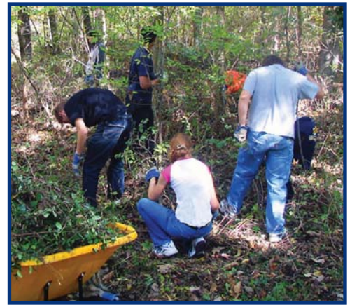
These volunteers helped clean invasive plants from the woods at George Owens Nature Park during ‘Weed Warrior Work Days’ in April.

“Leave No Trace” is a national education program dedicated to promoting and inspiring responsible recreational practices through education, research and partnerships. Trainer courses are designed for educators, scout leaders, agency employees, or any citizen interested in