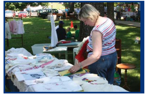
Bingham-Waggoner Antique & Craft Fair

Another photo opportunity is the 21st annual Antique and Craft Fair at the Bing-